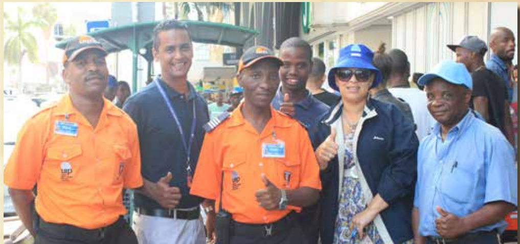
The UIP/Enforce and UIP/Cwebezela teams with UMZ officials

As of Friday, 29 January, the Urban Improvements Precincts (UIP) and the Urban Management Zone (UMZ) entered into a partnership to adopt the 320 Redefine Building Block between Mark Lane, Dr Pixley KaSema, Dorothy Nyembe and Monty Naicker Streets, with increased cleaning and security.