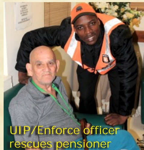
UIP/Enforce officer rescues pensioner