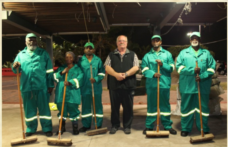
SHANELA ENVIRONMENTAL MANAGEMENT SERVICES

The UIP Company welcomes the BOSS team on board.