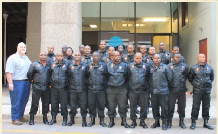
ENFORCE SECURITY SERVICES

Enforce Security Services is supported by a 25 member team that cover a 13 hour period, from 6am to 7pm from Mondays to Saturdays and from 8am to 3pm on Sundays. This skilled workforce, dedicated to the CBD and North East Business precincts patrol the streets as foot soldiers, closely monitoring daily crime and reporting it to the central Control Room for back-up in Bay Passage.