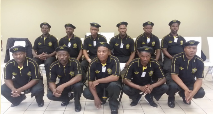
BLUE OCEAN SECURITY SERVICE

Suspicious persons loitering in this precinct included 7 people, with 2 incidents of theft and 1 case of cell phone theft reported. The UIP/Enforce crime monitors helped 6 members of the public.